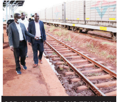
SGR ALLOCATED SH2 TRILLION FOR CONSTRUCTION. P24